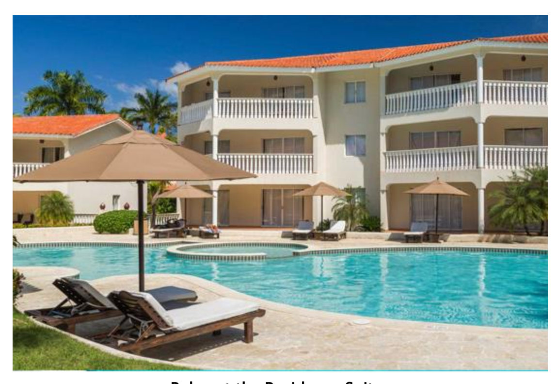
Relax at the Residence Suites

When you are ready to call it a day at the beach, come back to your Residence Suite, located right in the heart of a lush, green Dominican hillside. Our two bedroom suites are the perfect setting in which to enjoy all the comforts of home. Invite friends over for cocktails or take in a movie. Watch the sun set over the beach while sipping a glass of wine or a rich, warm cup of Dominican coffee. Your spacious and comfortable Residence Suite is designed to make you feel right at home, but without all the responsibility.