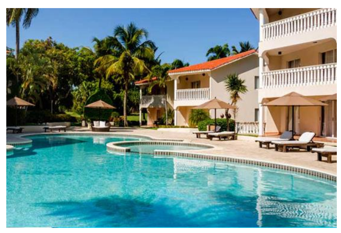
Royal Suites in Puerto Plata

Nestled inside the world-class Lifestyles Resorts, Royal Suites features six low rise modern Mediterranean-style buildings surrounding a beautiful pool.