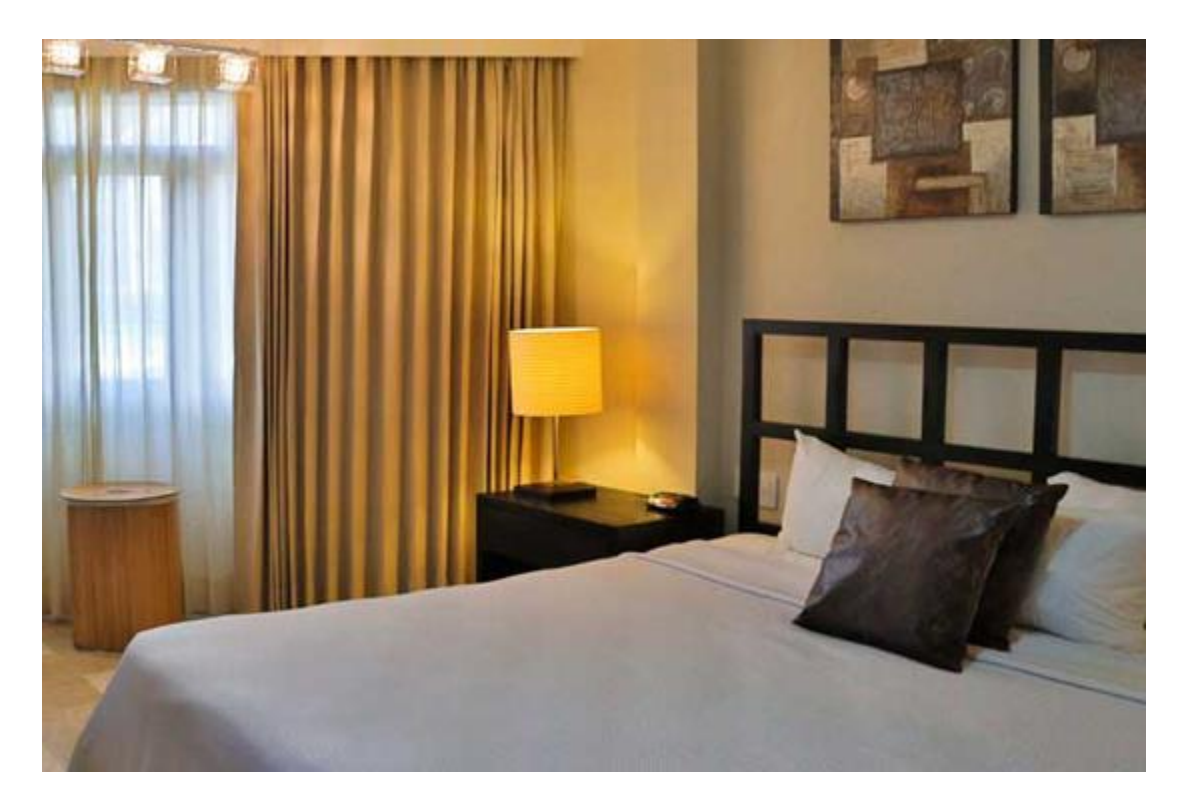
Enjoy a Five-Star Experience

Nestled inside the world-class Lifestyles Resorts, Royal Suites features six low rise modern Mediterranean-style buildings surrounding a beautiful pool. The resort provides a first class, five-star vacation experience. In addition to the Royal Suites swimming pool, tennis courts and beautiful beach, our guests will enjoy other resort swimming pools, multiple pool bars and restaurants, a fully equipped gym, a relaxing spa, a kid's club and multiple beach clubs.