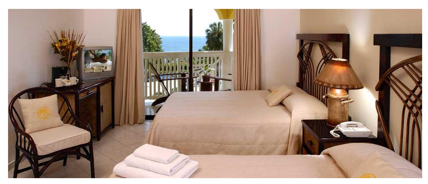
Experience The Tropical

Guest enjoy all resort facilities and amenities (excluding the V.I.P areas) including three swimming pools, a choice of excellent restaurants, exercise rooms, tennis courts, windsurfing and so much more. The Lifestyle Tropical is ideal for couples seeking a private island hide-away with all the advantages of a world-class resort.