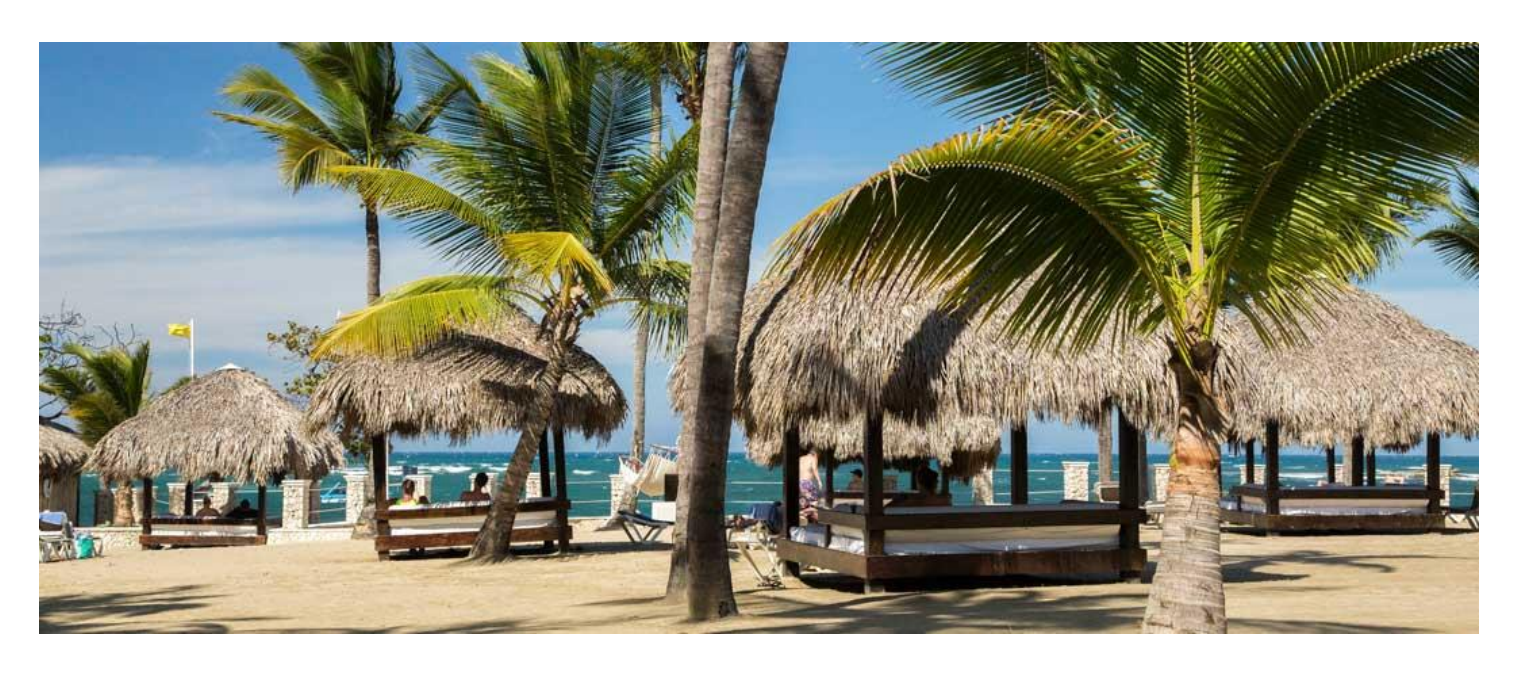
Experience The Cofresi Palm

All rooms feature modern comfortable furnishing, marble floors, air-conditioning, ceiling fans, most have flat-screen TVs, bathrooms with marble appointments, and hair dryers, safes and mini-bars. Some rooms have small kitchenettes, jetted tubs in unit, and terrace or balcony.