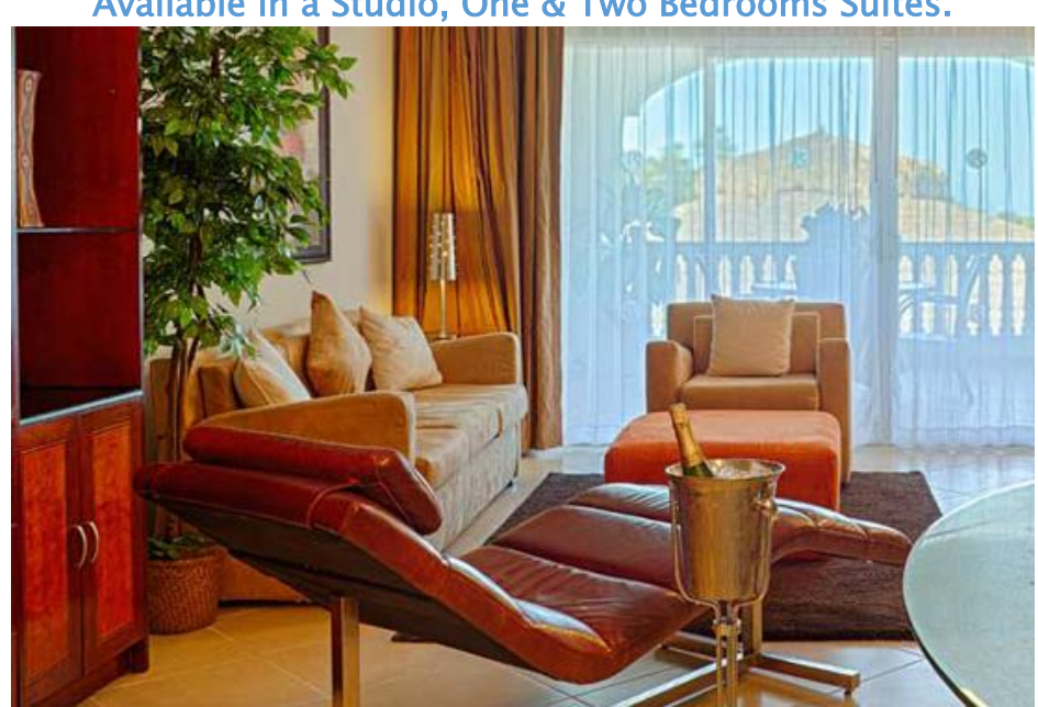
Available in a Studio, One & Two Bedrooms Suites.

Our spacious Presidential Suites feature open floor plans, dark wood furniture throughout and modern stainless steel appliances. Adorned with beautiful, islandthemed artwork, the Presidential Suites capture the very essence of the Caribbean. The shaded patios and verandas are the perfect place to relax with a great book or to gather with friends and family. We keep you cool in the tropical heat with air conditioning throughout the suite. Additional ceiling fans turn quietly overhead providing you with a cool, breezy atmosphere. Spacious and clean private bath areas come complete with a Jacuzzi tub and all the essentials you can possibly need to provide you with a personal spa-like experience.