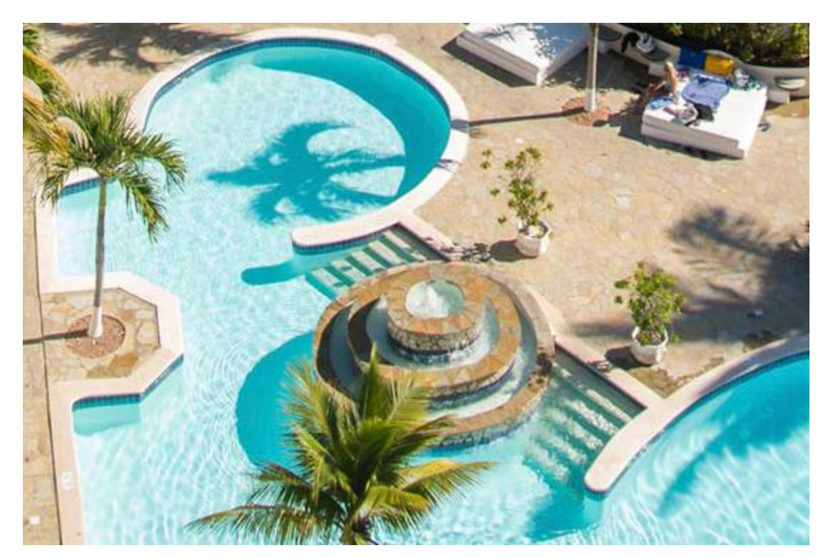
Relax at Lifestyle Resort, Puerto Plata

Bring the whole family for some quality time, or slip away for a more romantic stay for two in your own little island paradise. Take a stroll down to Cofresi Beach, a mere 3-minute walk from your front door! Sunbathe, swim, read a book, get to know the island locals or have a meal while taking in the most incredible views of your beach paradise. Not feeling like heading out? Your Crown Suite is the perfect place to find refuge. Lounge on your own personal veranda with a tropical drink as the sun sets along the coastline.