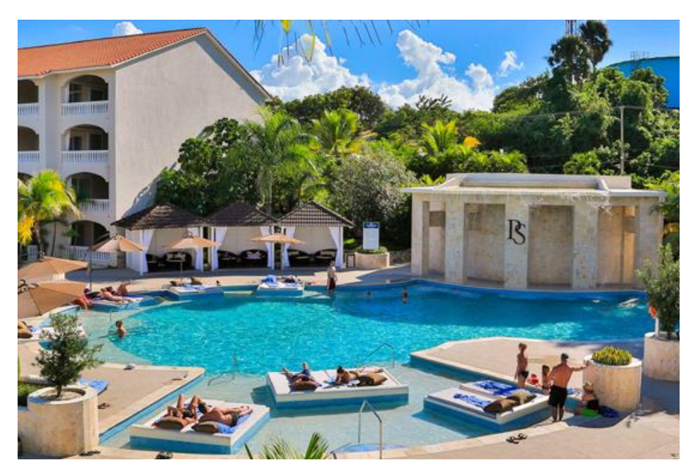
Presidential Suites at Lifestyle Resort

Our spacious Presidential Suites feature open floor plans, dark wood furniture throughout and modern stainless steel appliances. Adorned with beautiful, islandthemed artwork, the Presidential Suites capture the very essence of the Caribbean. The shaded patios and verandas are the perfect place to relax with a great book or to gather with friends and family. We keep you cool in the tropical heat with air conditioning throughout the suite. Additional ceiling fans turn quietly overhead providing you with a cool, breezy atmosphere. Spacious and clean private bath areas come complete with a Jacuzzi tub and all the essentials you can possibly need to provide you with a personal spa-like experience.