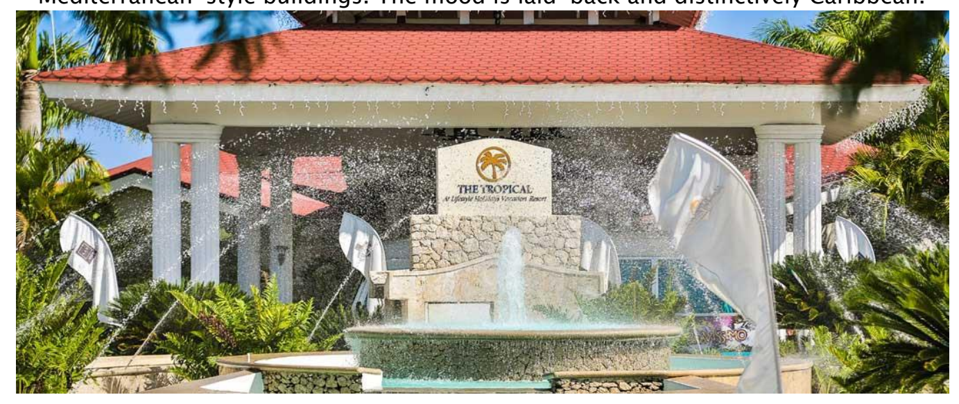
The Tropical at Lifestyle Holidays Vacation Resort

Set within the sprawling Lifestyle Holidays Vacation Resort, The Tropical offers a classic hotel vacation experience set within quaint, two- and three- story, Mediterranean-style buildings. The mood is laid-back and distinctively Caribbean.