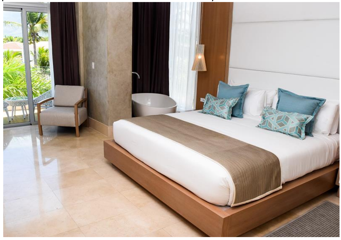
Click here for more info and images:

The Sunrise Suites are ideally located in a deluxe four-story building with breathtaking mountain and ocean views overlooking the entire resort at Puerto Plata. Built to the highest standards, sea, sun, sand and fun surround you here. Unique charm is found in the modern, tropical location and the intricate architecture of your one or two bedroom suite.