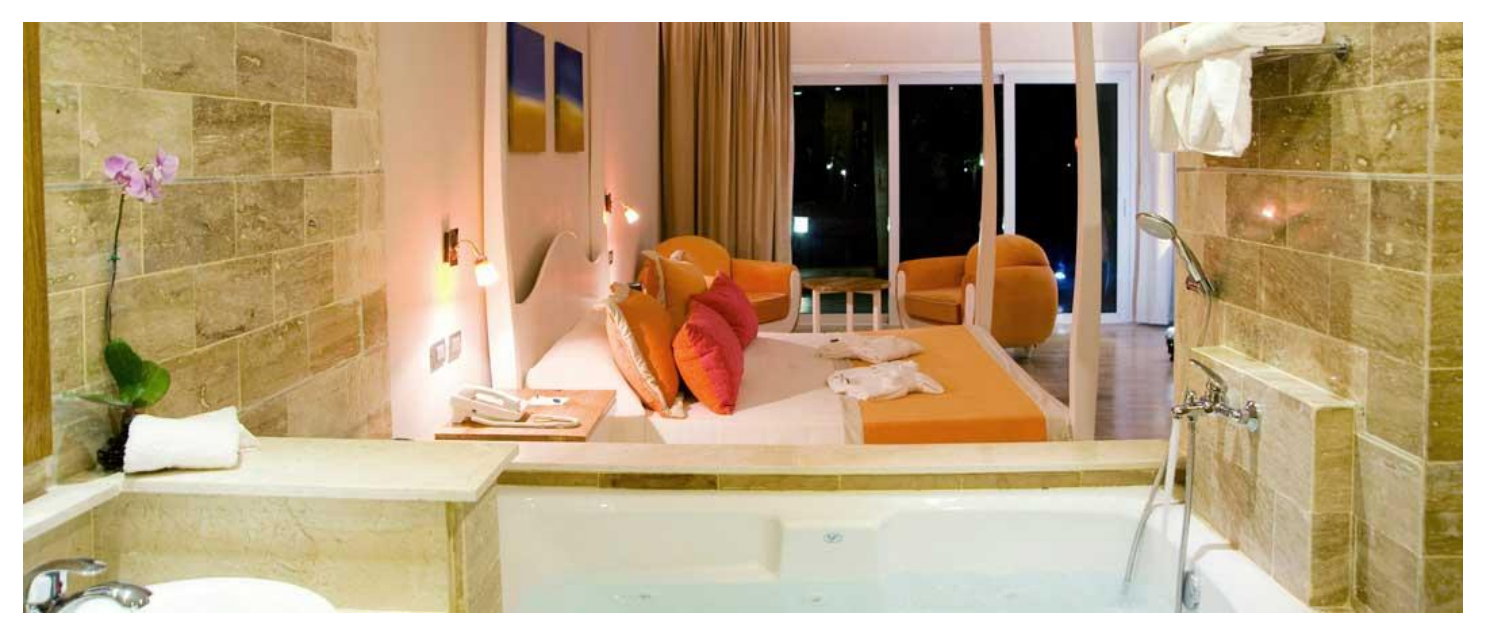
Cofresi Palm Beach & Spa Resort at Lifestyle Resort

This beautiful all-inclusive resort is comprised of several sections of units that are specific to a guests' vacationing requirements and include 18 exclusive adult only Spa Suites, 208 family friendly standard rooms, 180 Oceanside rooms in a mix of king and double beds, 60 residences for long term rentals and 2 spectacular Ocean view Penthouses.